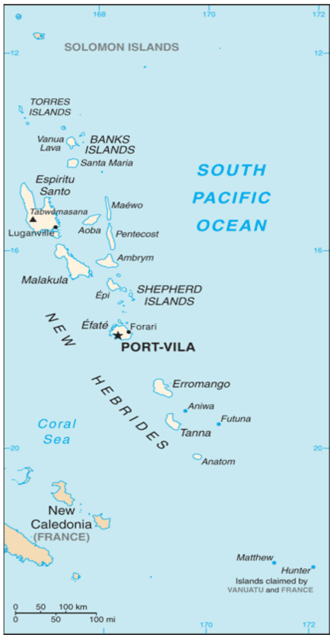
Figure 1. Map of Vanuatu

Neither Hayward nor Maxwell provide any methodological detail as to what might constitute a maritorial chorography. Following Derrida and Eisenman (1997) and Lukermann (1961), Olwig provides a starting point, suggesting that chorography seeks to present “the relational way in which place is experienced in the passage of a journey